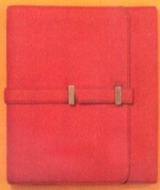
LEATHER IPAD CASE, £750, BY VICTORIA BECKHAM

The new boss who didn't recruit you and therefore may sack you So either you'll look like a hideous sycophant or a generous soul with flair, imagination and chutzpah. Could go either way, but it's surely worth a go.