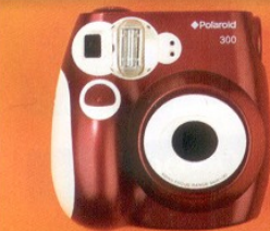
CAMERA, £85, BY POLAROID, AT GIFT LIBRARY

The lawyer who always gets you out of trouble