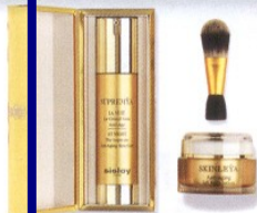
SUPREMYA NIGHT CREAM, £455; SKINLEYA FOUNDATION £510, BOTH BY SISLEY, AT HARRODS