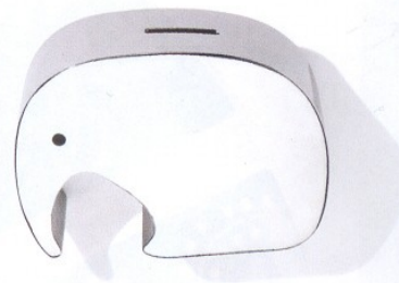
MONEYPHANT, £75, BY GEORG JENSEN