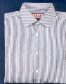
COTTON SHIRT, £89, BY THOMAS PINK

If it weren't for him you'd be in jail for fraud/harassment/other (delete as appropriate). He's saved your business and your reputation. If you don't show him the love, then you're a fool.