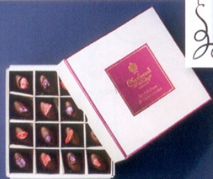
ENGLISH ROSE & VIOLET CREAMS, £18, BY CHARBONNEL ET WALKER