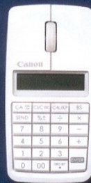
X MARK 1 MOUSE, £35, BY CANON, AT AMAZON

The new boss who didn't recruit you and therefore may sack you So either you'll look like a hideous sycophant or a generous soul with flair, imagination and chutzpah. Could go either way, but it's surely worth a go.