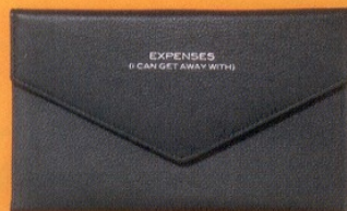
LEATHER ENVELOPE, £78, BY THOMAS LYTE