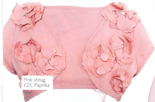
Pink shrug, £25, Paprika