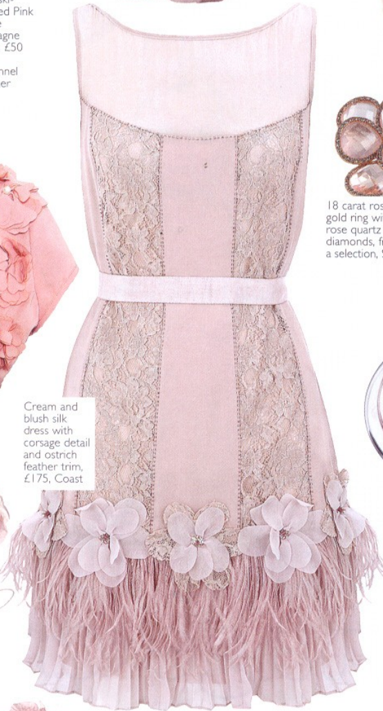
Cream and blush silk dress with corset detail and ostrich feather trim, £175, Coast