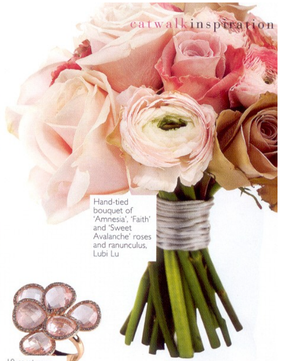
Hand-tied bouquet of 'Amnesia', 'Faith' and 'Sweet Avalanche' roses and ranunculus, Lubi Lu