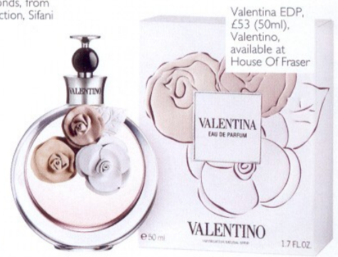
Valentina EDP, £53 (50ml), Valentino, available at House Of Fraser