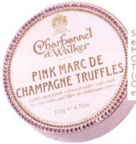
Swarovski-encrusted Pink Marc de Champagne Truffles, £50 (135g), Charbonnel et Walker