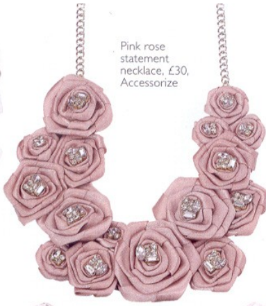
Pink rose statement necklace, £30, Accessorize