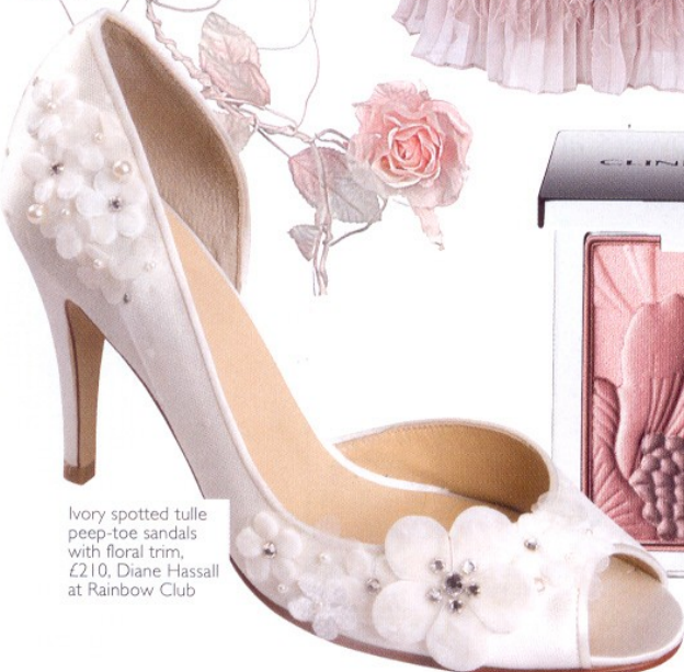
Ivory spotted tulle peep-toe sandals with floral trim, £210, Diane Hassall at Rainbow Club