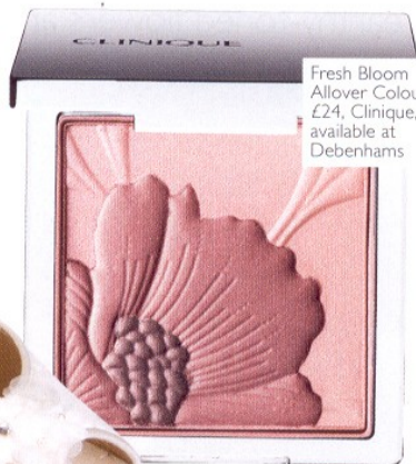
Fresh Bloom All-over Colour, £24, Clinique, available at Debenhams