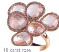
18 carat rose gold ring with rose quartz and diamonds, from a selection, Sifani