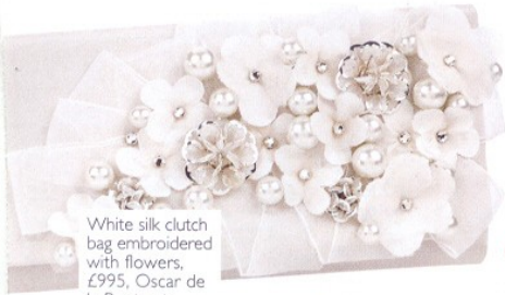
White silk clutch bag embroidered with flowers, £995, Oscar de la Renta at Net-a-Porter