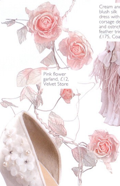
Pink flower garland, £12, Velvet Store